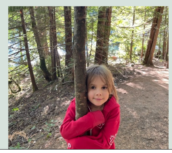
(Literal tree-hugging encouraged, but not required.)

If you would like more information about the work of the Board, or you are wanting to speak to a Board member, please send an email with your contact information to <a href="mailto:northislandgreens@gmail.com">northislandgreens@gmail.com</a> and we will get back to you!