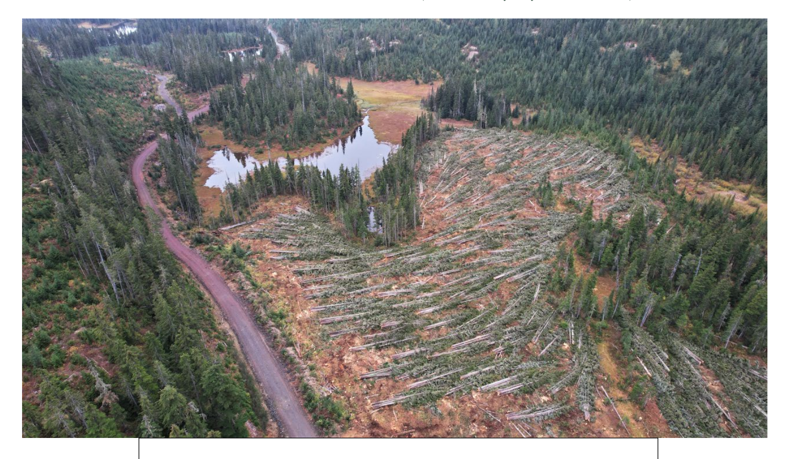
Old Growth Clearcut at Ramparts Creek Headwaters